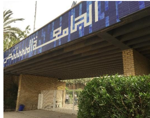
B. Mustansiriyah University (author)