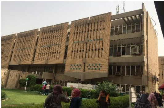
Figure 2. A. Mustansiryia University (author)

Dealing with the hot dry weather in Iraq, modern architects used different treatments to reduce sun rays and reduce heat gain, like screens mainly used by Iraqi architects abstracting local craft ornamentations and applying them to brick and hollow block screen walls in front of wide windows of modernity, this appeared in the campus of Mustansiryia designed by Qahtan Awni, and Perforated curtain walls in the Ministry of Industry and Minerals for Fadhil Ajina Fig. 2 .