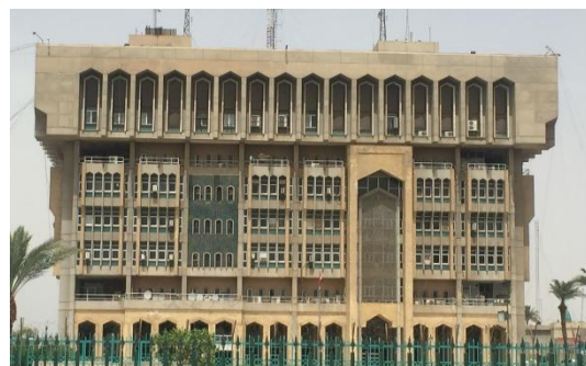
B. Morality of Baghdad