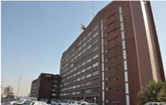
Figure 4. A. ministry of planning https://www.almaalomah.com

by Awni and Baghdad University by Gropius, unglazed ceramic is used in the whole facing of the ministry of planning building by Gio Ponti Fig. 4.