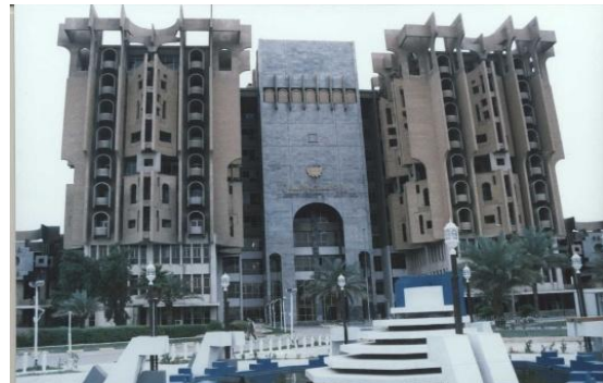
B. Ministry of Industry and Minerals ( https://www.alsumaria.tv/news )