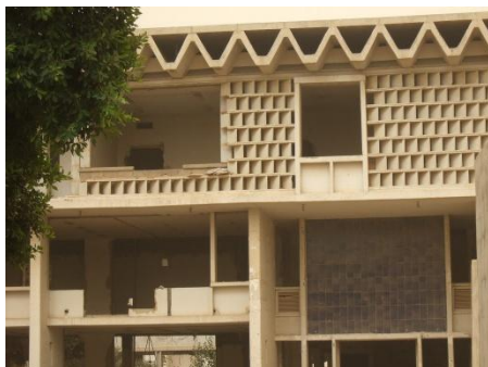
Figure 3. A. embassy of U.S.A Al-Sultani 2014, p.78

Also meant to deal with weather influences but architects used different types and sizes of louvers in modern building in Baghdad, as we see in the campus of Baghdad university by Gropius, and mixture of louvers and screens in the elevations of the embassy of the United States in Baghdad by Sert Fig.3 .