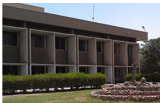
B. University of Baghdad (author)