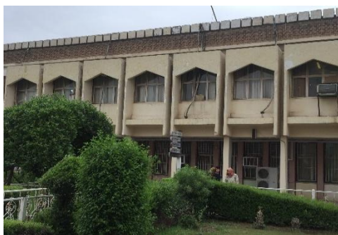
Figure 5. A. Faculty of Education

Iraqi modernists worked on abstracting the heritage elements like historical Islamic arches and the traditional vernacular ones in many ways to fit them into regionalized modern architecture, each architect had his own way of doing that in elevations. Mohamad Makyia, Rifaat Chaderchi and Nasir Al Asadi were the main architects to work with modernizing arches Fig. 5.