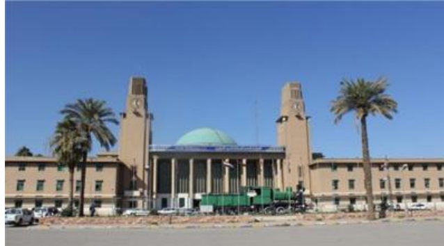
Figure 1. Baghdad central station, designed by J.M.

In late 19 th century, the Ottoman government asked Germany to build a railway line from Europe to the middle east, that was the beginning of the (Orient Express) and the Berlin Baghdad line. German engineers brought modern designs and building materials to Iraq and did few buildings specially railway stations ( Fig.1 ), Al-Sultany, 2013. , but it was not until 1921 that architectural activity got its entity and witnessed huge change, this took place with the work of British army architects who took the position of (GA), government architect, and designed many buildings which were needed by the new state of Iraq. First Iraq architect to take this position and become the director of the public works office was Ahmed Mukhtar Ibrahim in 1939, yet British architecture kept working In Iraq in that period, Al-Sultany, 2000