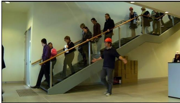
Figure 4. The training process for a population.

very important because it depends on time and calculates the exit of residents in specific time frames because the residents inside the building are trapped, leading to the possibility of death. Sometimes the number of trapped residents is reduced through the efforts of civil defense men (Hadjisophocleous and Fu, 2004). Fig. 4 shows the training process for a population.