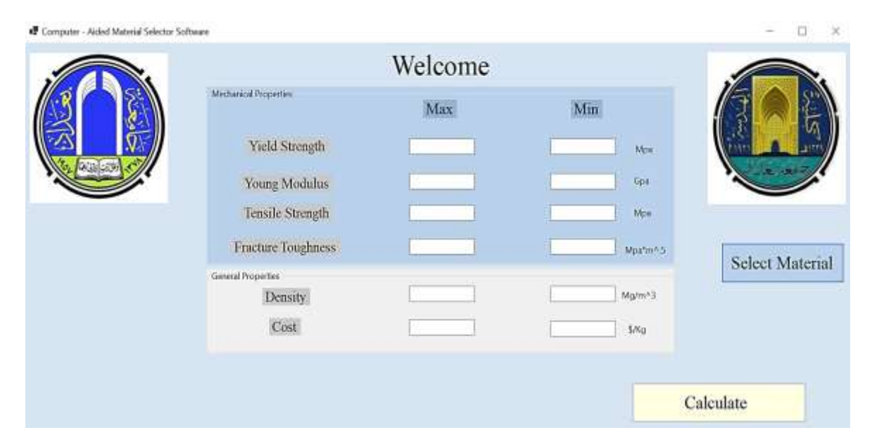
Figure 2. The design specifications window for level two.

A property form is displayed as shown in Fig. 2 , and clicking "select material" generates a list of candidate materials that meet the design's requirements. The candidate materials are shown in Fig. 3 .