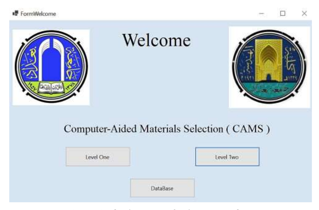
Figure 1. The (user interface) main window.

Implementing the Case Study in the (CA-MS) System Software begins by clicking the selection model (Level Two) for the multi-indices phase in the program's main form, as shown in Fig. 1 .