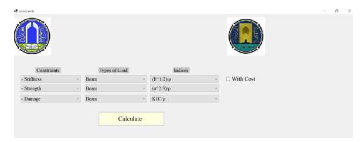
Figure 4. Drone wings performance indices.

determine the indices' weights using Eqs. (8 to 11). In the last step, the performance indices were ranked using the GRA method to select the optimal material using Eqs. (1 to 7). By deactivating cost and pressing "calculate," the software runs on the material selection problem based on design requirements. The software results show that CFRP is the best candidate material due to its excellent stiffness and strength performances, while AL-alloys, followed by GFRP, perform the least, as shown in Fig. 5 .