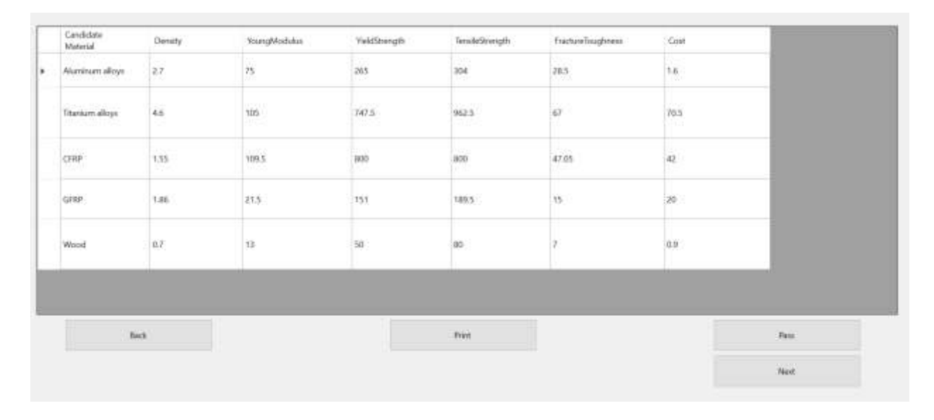
Figure 3. Candidate materials used for manufacturing Drone wings.

Once the user clicks "next," the process advances to the second phase, which displays the form for selecting performance indices. According to the design requirements, the performance indices stiffness, strength, and fracture toughness are shown in Fig. 4 .